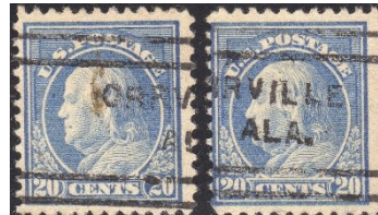
ORRVILLE 7.4643 DLR